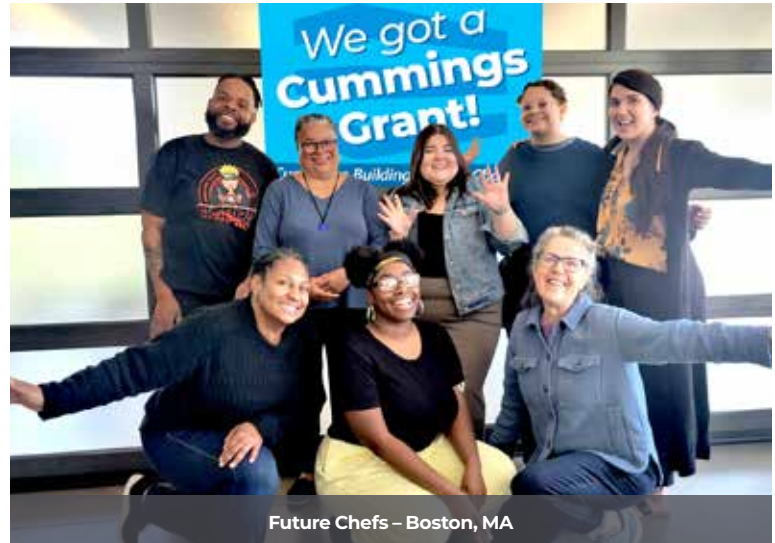
Future Chefs – Boston, MA

Visit CummingsFoundation.org to learn more about the 2023 grant cycle and 2022 NEXT Grants winners, and review a comprehensive list of the more than 1,400 nonprofits awarded funding since the Foundation formalized its grant-making process in 2012.