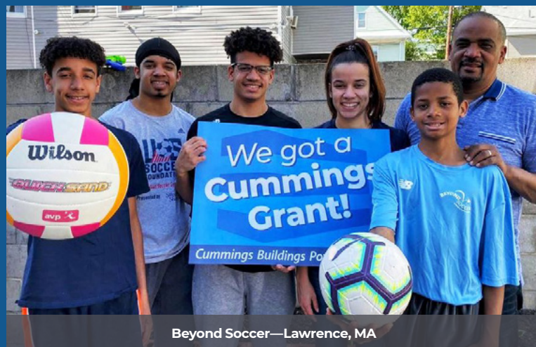
Beyond Soccer—Lawrence, MA

More information about the 2020 grants programs and a complete list of the nearly 1,000 grant winners since the program began in 2012 are available at CummingsFoundation.org .